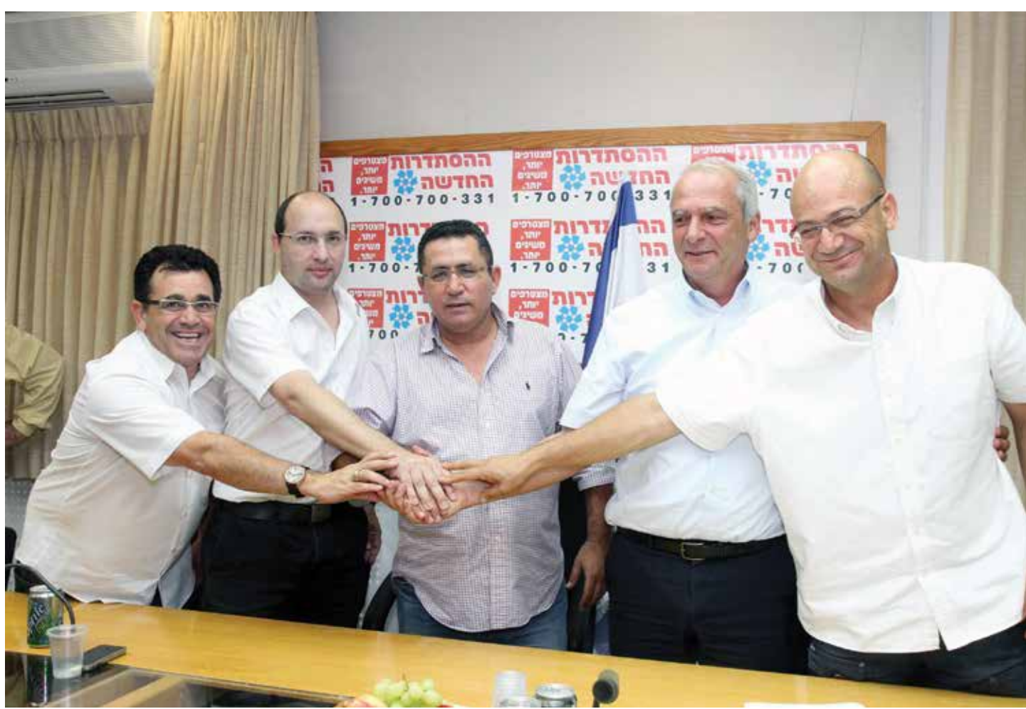
Signing the collective agreement for the construction industry

created misunderstandings. Our goal was to build a standardized pay-slip, correct, accurate and proper so that everybody – workers and employers – could know and understand the meaning of each and every item."