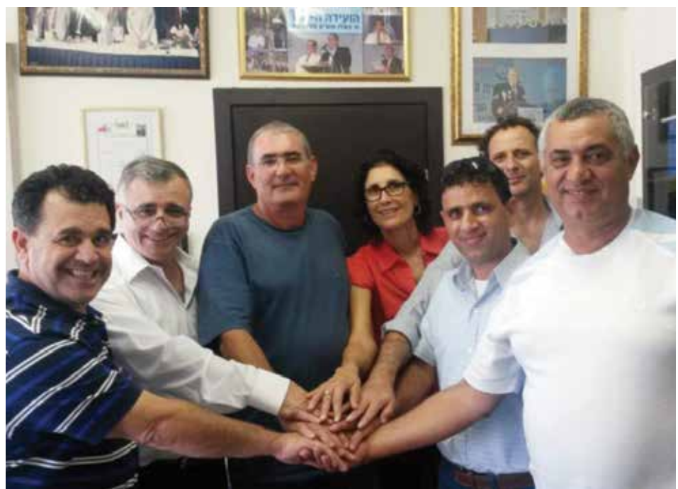
Signing the agreement at Even V'Sid

Solel Boneh, of the Shikun & Binui group – Several agreements were signed at this company over the last three years. One was a unique agreement: a safety agreement – the first in the industry – designed to anchor the principles of safety at construction sites by defining the powers of function holders, and establishing a