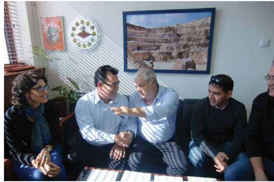
Signing a collective agreement at Even V'Sid