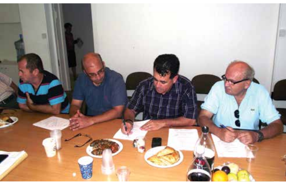
Signing collective agreements at Ashkelit 268 and Netivei Noy - of the Ashtrom Group