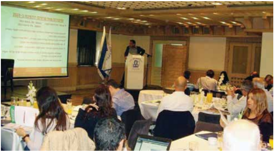
Convention to promote employment in construction, and on the principles of the uniform pay-slip, January 2012

At the start of 2012, Israel Builders Association - Boney Ha'aretz, together with the Foundation for Support and Development of the Construction Field in Israel and Construction and Wood Workers Union, held a day of studies on the new pay slip. Representatives of construction companies