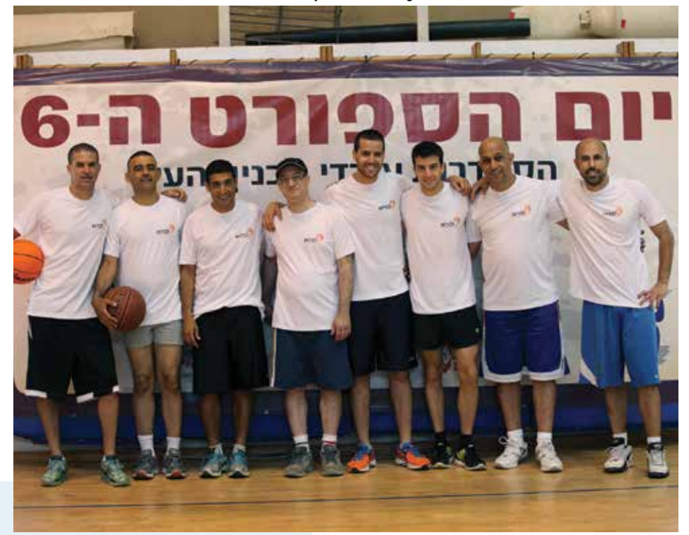
Field Day for the Construction and Wood industry workers

International Women's Day events. The construction industry is perceived as a place for men. Two years ago the union decided to start a new tradition, once a year training the spotlight on the women working in administration, who make a great contribution to the industry's prosperity and success. This event also reflects the high esteem for the many roles women take on as workers, mothers and managers of home and family. The first event, which was an impressive one, was held in 2012, at a highly-invested gala event – an outing for women with a lot of laughter, good food, music and special shows.